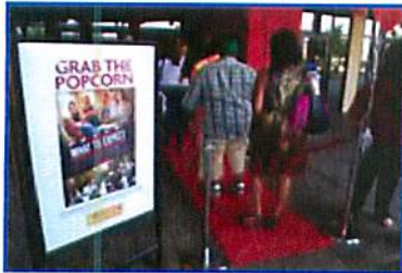
Southern Regional Medical Center staff, and community officials make their way down a miniature red carpet outside AMC Southlake movie theater, in Morrow, on Friday for a screening of "What to Expect When You're Expecting." Part of the movie was filmed at Southern Regional.

City of Morrow leaders on Friday, after a screening of the film "What to Expect When You're Expecting," at AMC Southlake movie theater, in Morrow. Part of the movie was filmed at the hospital.